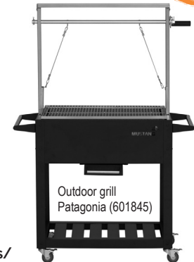
Outdoor grill Patagonia (601845)

See all products at mustang-grill.com/en/category/grills/charcoal-grills/