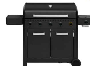
Connoisseur with five burners (613334)

See all products at mustang-grill.com/en/category/grills/gas-grills/