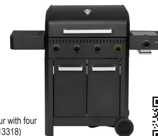
Connoisseur with four burners (613318)

See all products at mustang-grill.com/en