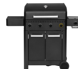
Connoisseur with four burners (613318)