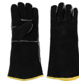
Leather grilling gloves (603430)