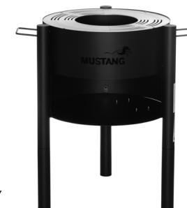
Outdoor grill Oakdale (601849)