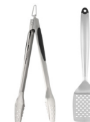
Grilling tool set (604045)