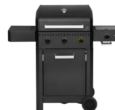
Connoisseur with three burners (613313)